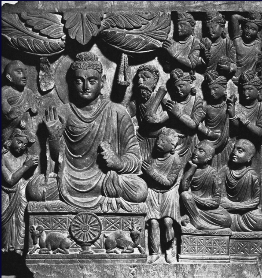
The first sermon, one of four sides of a stupa harmika, Gandhara ca. 2nd Century CE Freer Gallery of Art ©, Washington D.C.