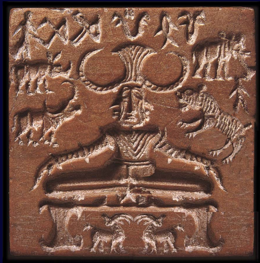
Computer graphics restoration by JCH