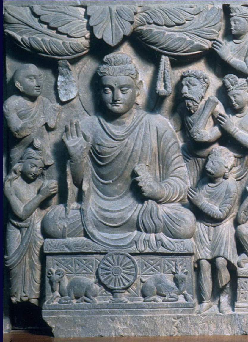
2nd cent CE image of the first sermon from Gandhara