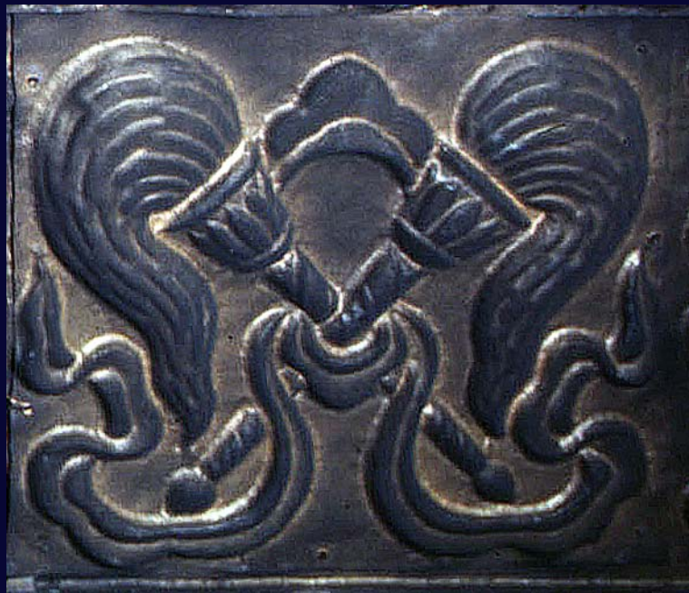
Detail of the metal ceiling in Basupur at Swayambhu Mahachaitya, modern

After the end of the Licchavi period, (ca. 330 to 879/880) the Dharma chakra and the deer flanking it drop out of the Newar Buddhist vocabulary. For reasons I do not understand, even in the astamangala symbolism, the chakra is replaced by the two crossed chauries.