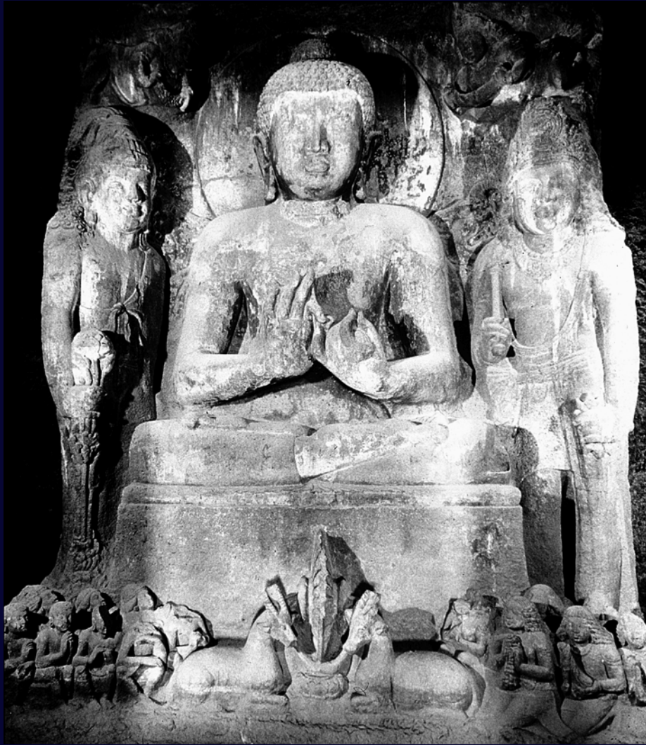
Cave 4, shrine image with a teaching Buddha and Vajrapani and Avalokiteshvara the antelope flank a edge-on wheel