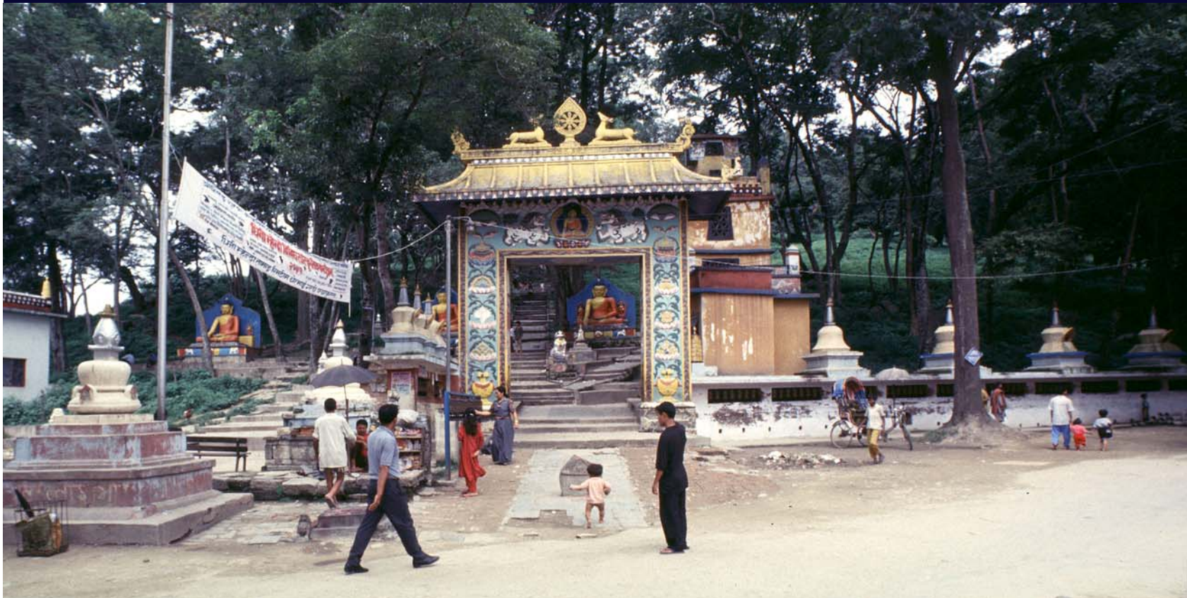
East entrance of Swayambhu Mahachaitya, with a torana offered by a Tibetan modern

In Nepal, even at Swayambhu Mahachaitya the core site of Newar Buddhism, the mriga and chakra symbols are present only because of offerings by the Tibetan community. I am sure this fact is confusing to most, but the Newar Buddhist community and the Tibetan Buddhist community have a very long standing relationship of mutual respect and tolerance.